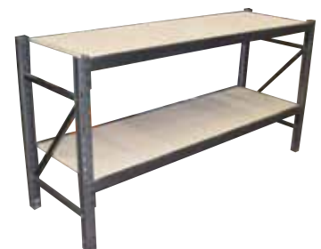
2 Tier Longspan Workbench