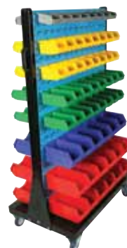
Mobile Plastic Bin Trolley