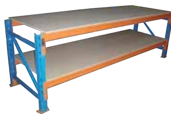
2 Tier Rack Workbench