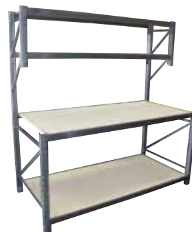
4 Tier Longspan Workbench