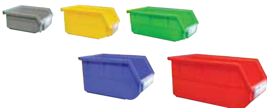
Assorted Plastic Bins