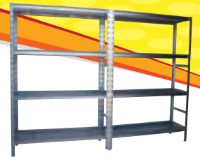
Cool Room Shelving