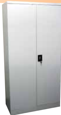
2 Door Cabinets