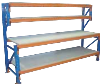
4 Tier Rack Workbench