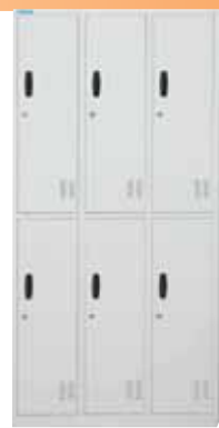
Multiple Door Locker