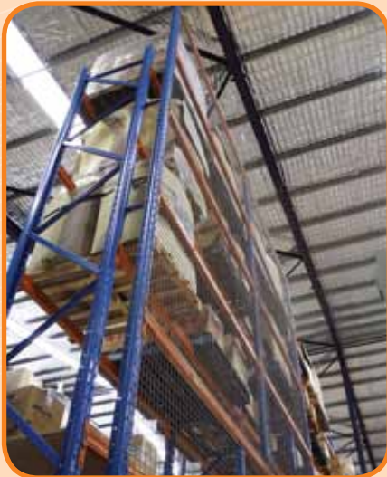
Meshed Backed Racking