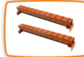
Fork Entry Bars