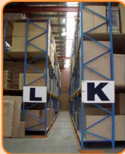
Narrow Isle Racking