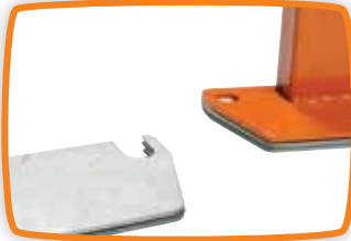
Base Plate Shims