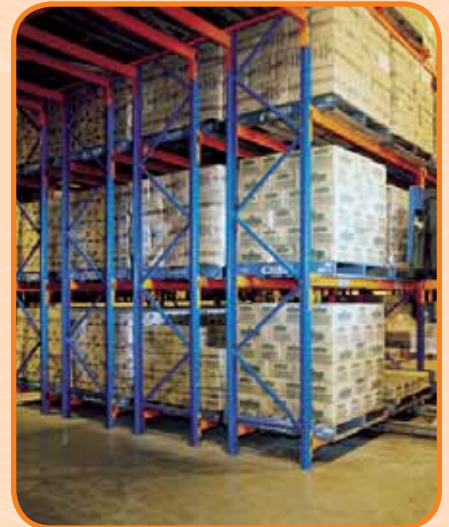
Double Deep Racking